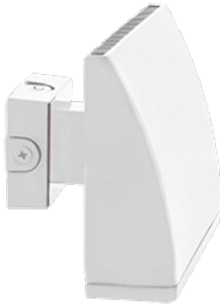
LED 52W Wallpacks. 3 cutoff options. Patent Pending thermal management system. 100,000 hour L70 lifespan. 5 Year Warranty.