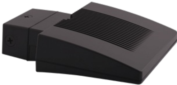
LED 26W Wallpacks. Patent Pending thermal management system. 100,000 hour L70 lifespan. 5 Year Warranty.