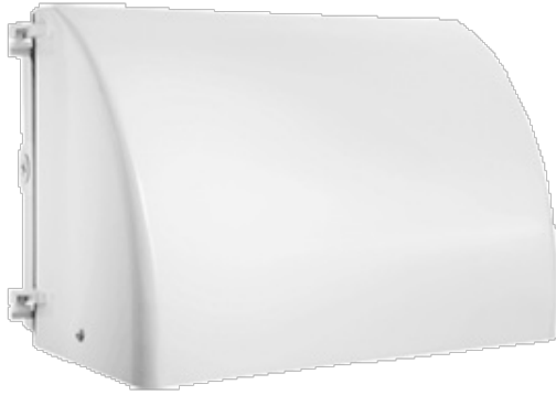
Mid sized full cutoff wallpack with emergency battery Backup.