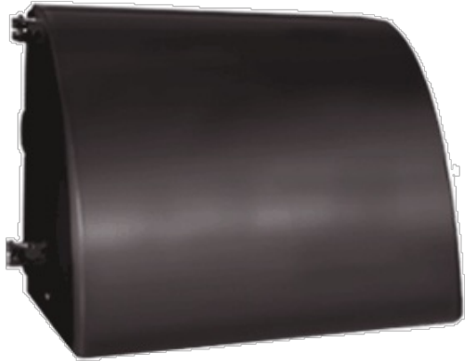
Mid sized full cutoff wallpack with emergency battery Backup.