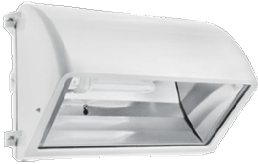
Mid sized wallpack with emergency battery Backup and cutoff glare shield.