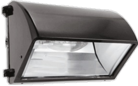
Mid sized wallpack with emergency battery Backup and cutoff glare shield.