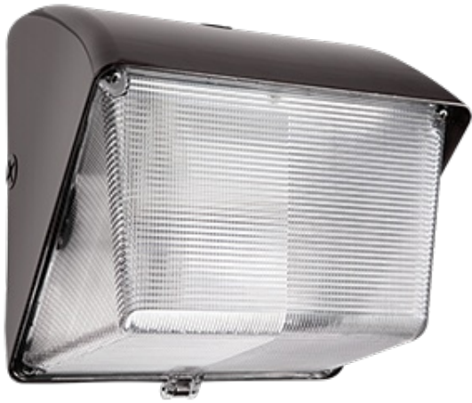
Compact Wallpack. UV stabilized, vandal resistant prismatic polycarbonate refractor. Lamp supplied.