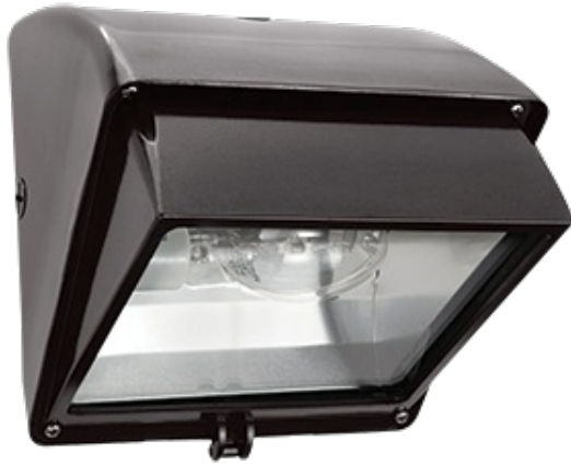
Cutoff Wallpack with glare shield for 35 - 100W HPS, 50 - 100W MH (Pulse Start Standard) or 42W CFL. Lens is flat, tempered glass. 30° cutoff strip included. Lamp supplied.