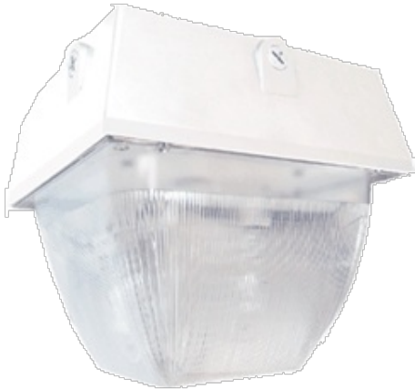
VAN5 12" x 12" Emergency Battery Backup. 2x 32W CFL or 2x 42W CFL. Available in 120V or 277 volts. Emergency battery operates only one lamp. Lamp supplied.