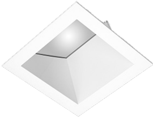
Die-cast aluminum trim cone with high-efficiency TIR optics.