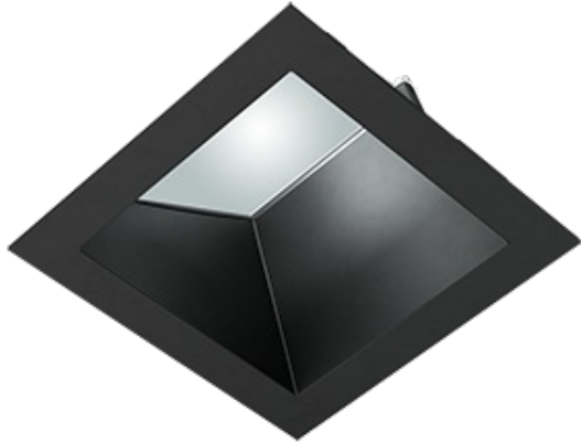
Die-cast aluminum trim cone with high-efficiency TIR optics.