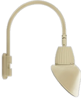
13 & 26 Watt Angled Cone Shade LED Gooseneck Luminaire designed to match the architecture of Main Street storefronts and building perimeters. LED Gooseneck Cone with Pole 20" High, 19" from Pole Goose Arm Style 5.