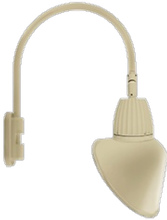
13 & 26 Watt Angled Cone Shade LED Gooseneck Luminaire designed to match the architecture of Main Street storefronts and building perimeters. LED Gooseneck Cone with Pole 20" High, 19" from Pole Goose Arm Style 5.