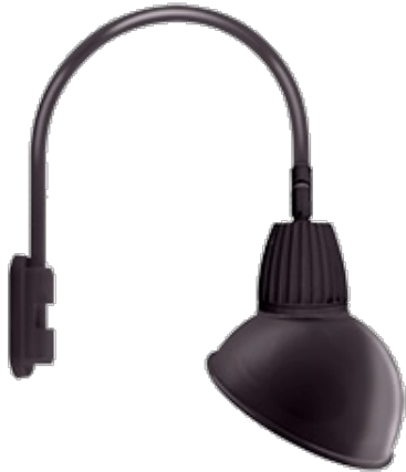
13 & 26 Watt Dome Shade LED Gooseneck Luminaire designed to match the architecture of Main Street storefronts and building perimeters. LED Gooseneck Dome Shade with Pole 20" High, 19" from Pole Goose Arm Style 5.