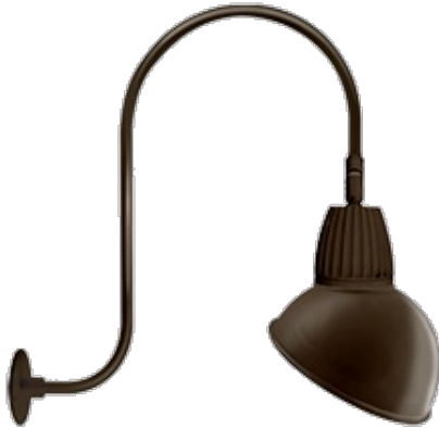
13 & 26 Watt Dome Shade LED Gooseneck Luminaire designed to match the architecture of Main Street storefronts and building perimeters. LED Gooseneck Dome Shade with Upcurve 30" High, 25" from Wall Goose Arm Style 3.