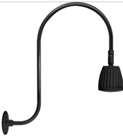
13 & 26 Watt No Shade LED Gooseneck Luminaire designed to match the architecture of Main Street storefronts and building perimeters. LED Gooseneck No Shade with Upcurve 30" High, 25" from Wall Goose Arm Style 3.