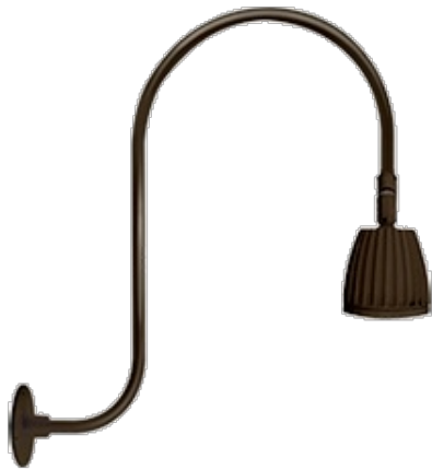
13 & 26 Watt No Shade LED Gooseneck Luminaire designed to match the architecture of Main Street storefronts and building perimeters. LED Gooseneck No Shade with Upcurve 30" High, 25" from Wall Goose Arm Style 3.