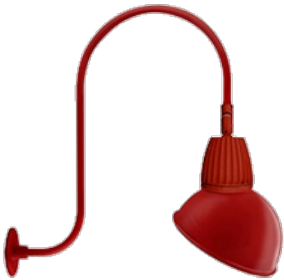
13 & 26 Watt Dome Shade LED Gooseneck Luminaire designed to match the architecture of Main Street storefronts and building perimeters. LED Gooseneck Dome Shade with Upcurve 30" High, 25" from Wall Goose Arm Style 3.