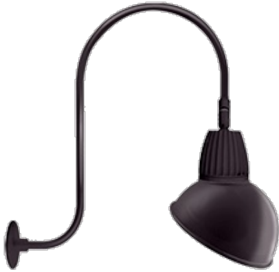
13 & 26 Watt Dome Shade LED Gooseneck Luminaire designed to match the architecture of Main Street storefronts and building perimeters. LED Gooseneck Dome Shade with Upcurve 30" High, 25" from Wall Goose Arm Style 3.