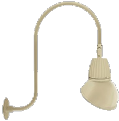
13 & 26 Watt Dome Shade LED Gooseneck Luminaire designed to match the architecture of Main Street storefronts and building perimeters. LED Gooseneck Dome Shade with Upcurve 30" High, 25" from Wall Goose Arm Style 3.