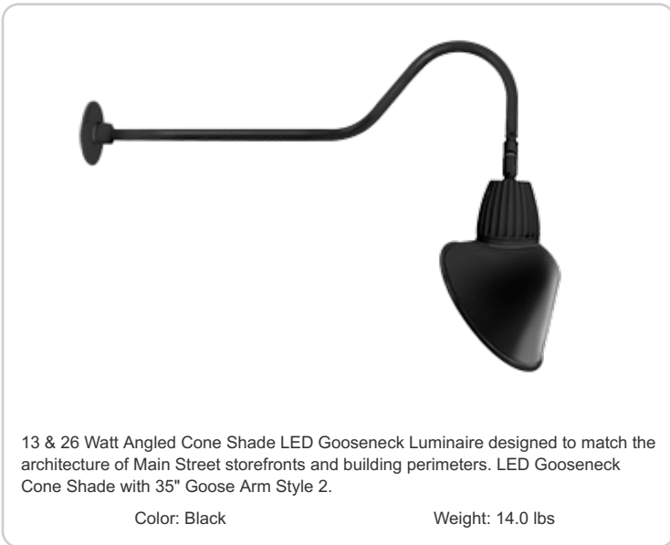
13 & 26 Watt Angled Cone Shade LED Gooseneck Luminaire designed to match the architecture of Main Street storefronts and building perimeters. LED Gooseneck Cone Shade with 35" Goose Arm Style 2.