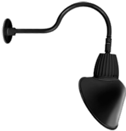
13 & 26 Watt Angled Cone Shade LED Gooseneck Luminaire designed to match the architecture of Main Street storefronts and building perimeters. LED Gooseneck Cone Shade with 24" Goose Arm Style 1.