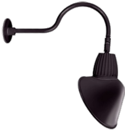
13 & 26 Watt Angled Cone Shade LED Gooseneck Luminaire designed to match the architecture of Main Street storefronts and building perimeters. LED Gooseneck Cone Shade with 24" Goose Arm Style 1.