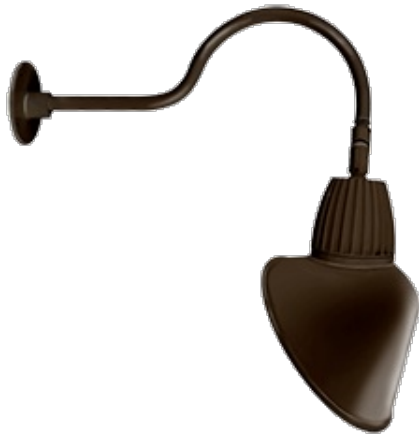
13 & 26 Watt Angled Cone Shade LED Gooseneck Luminaire designed to match the architecture of Main Street storefronts and building perimeters. LED Gooseneck Cone Shade with 24" Goose Arm Style 1.