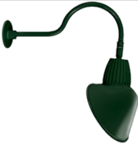
13 & 26 Watt Angled Cone Shade LED Gooseneck Luminaire designed to match the architecture of Main Street storefronts and building perimeters. LED Gooseneck Cone Shade with 24" Goose Arm Style 1.