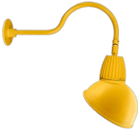
13 & 26 Watt Dome Shade LED Gooseneck Luminaire designed to match the architecture of Main Street storefronts and building perimeters. LED Gooseneck Dome Shade with 24" Goose Arm Style 1.