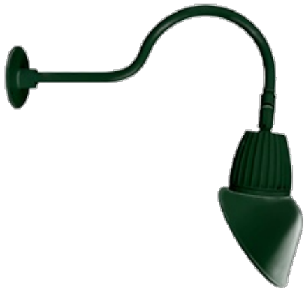
13 & 26 Watt Angled Cone Shade LED Gooseneck Luminaire designed to match the architecture of Main Street storefronts and building perimeters. LED Gooseneck Cone Shade with 24" Goose Arm Style 1.