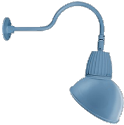
13 & 26 Watt Dome Shade LED Gooseneck Luminaire designed to match the architecture of Main Street storefronts and building perimeters. LED Gooseneck Dome Shade with 24" Goose Arm Style 1.