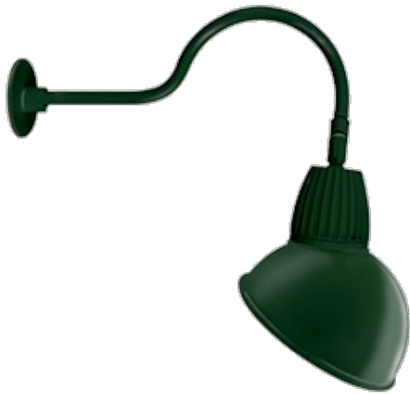
13 & 26 Watt Dome Shade LED Gooseneck Luminaire designed to match the architecture of Main Street storefronts and building perimeters. LED Gooseneck Dome Shade with 24" Goose Arm Style 1.