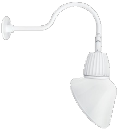
13 & 26 Watt Angled Cone Shade LED Gooseneck Luminaire designed to match the architecture of Main Street storefronts and building perimeters. LED Gooseneck Cone Shade with 24" Goose Arm Style 1.