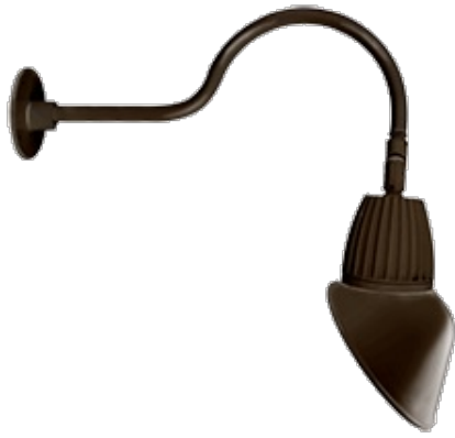
13 & 26 Watt Angled Cone Shade LED Gooseneck Luminaire designed to match the architecture of Main Street storefronts and building perimeters. LED Gooseneck Cone Shade with 24" Goose Arm Style 1.