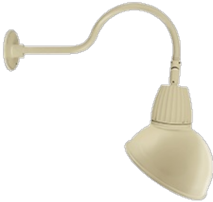
13 & 26 Watt Dome Shade LED Gooseneck Luminaire designed to match the architecture of Main Street storefronts and building perimeters. LED Gooseneck Dome Shade with 24" Goose Arm Style 1.