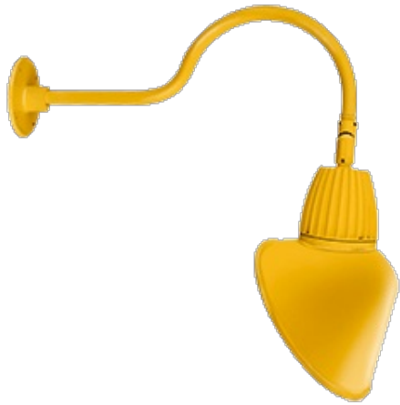
13 & 26 Watt Angled Cone Shade LED Gooseneck Luminaire designed to match the architecture of Main Street storefronts and building perimeters. LED Gooseneck Cone Shade with 24" Goose Arm Style 1.