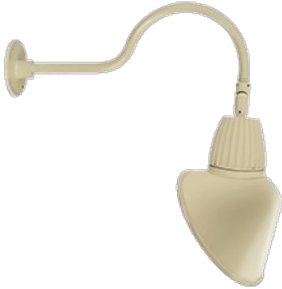
13 & 26 Watt Angled Cone Shade LED Gooseneck Luminaire designed to match the architecture of Main Street storefronts and building perimeters. LED Gooseneck Cone Shade with 24" Goose Arm Style 1.