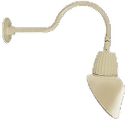
13 & 26 Watt Angled Cone Shade LED Gooseneck Luminaire designed to match the architecture of Main Street storefronts and building perimeters. LED Gooseneck Cone Shade with 24" Goose Arm Style 1.