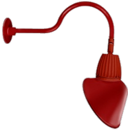
13 & 26 Watt Angled Cone Shade LED Gooseneck Luminaire designed to match the architecture of Main Street storefronts and building perimeters. LED Gooseneck Cone Shade with 24" Goose Arm Style 1.