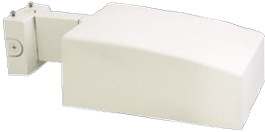
Type II distribution wall mount Area Light with 4" arm for use at 10' - 15' height. Fixed mounting at 90° to wall. Lamp supplied.