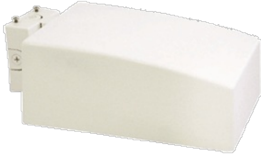
Type II distribution flat wall mount Area Light with 4" arm for use at 10' - 15' height. Fixed mounting at 90° to wall. Lamp supplied