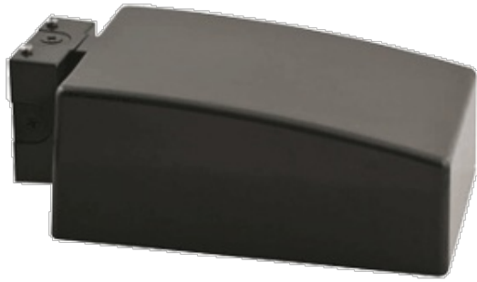
Type II distribution flat wall mount Area Light with 4" arm for use at 10' - 15' height. Fixed mounting at 90° to wall. Lamp supplied