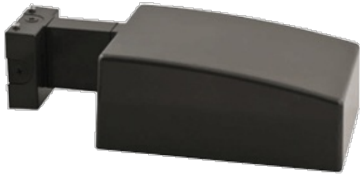
Type II distribution wall mount Area Light with 4" arm for use at 10' - 15' height. Fixed mounting at 90° to wall. Lamp supplied.